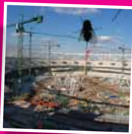
Webcam fly This fly was spotted by the London 2012 webcams buzzing around the Olympic Stadium site. The webcams let you be the fly on the wall and watch progress on Olympic Park venues as it happens. Visit london2012.com/webcams