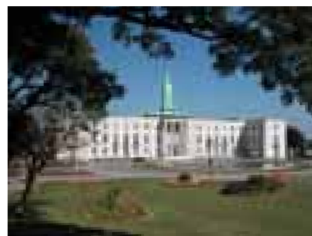
Waltham Forest , Waltham Forest Town Hall

LOCOG Chair Sebastian Coe said: 'The landmarks chosen by the public for the pin set showcase