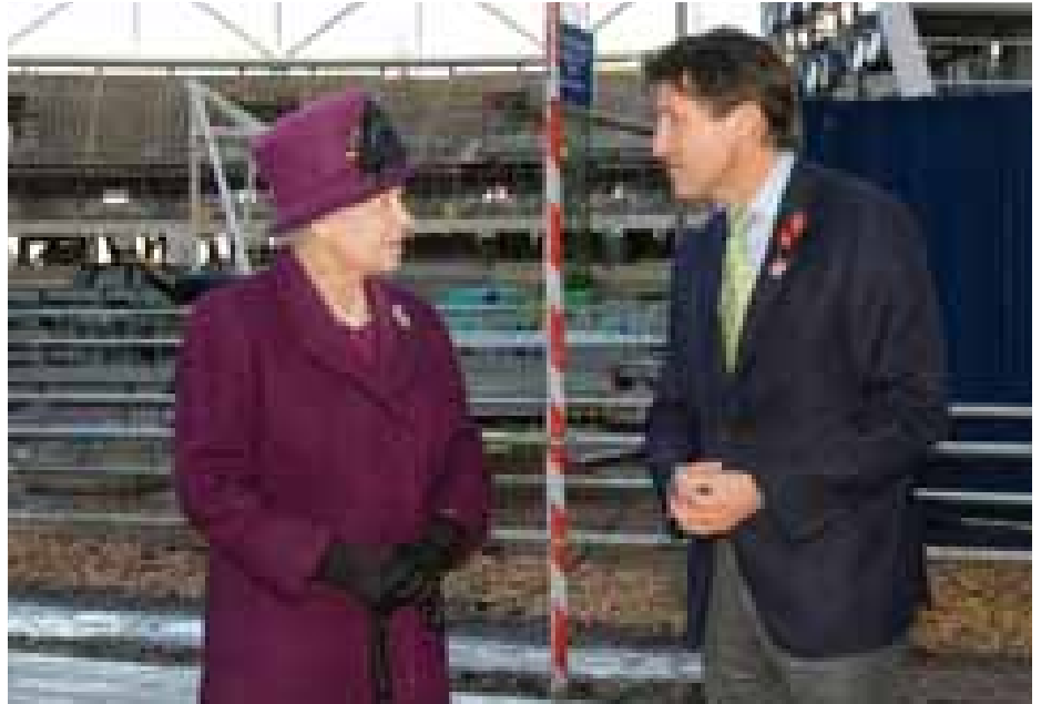
Seb Coe shows Her Majesty The Queen where the 100m track will be in the Olympic Stadium