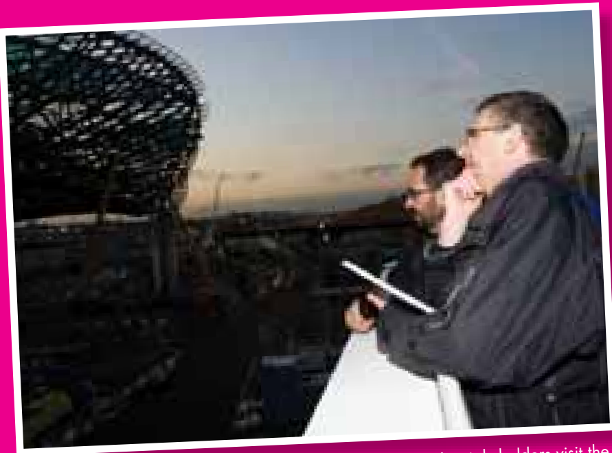
Olympic Park Engagement Network (OPEN) Local community stakeholders visit the Aquatics Centre as part of the biannual OPEN Meeting.