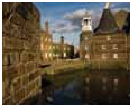
Newham , Three Mills