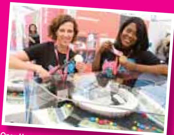
Open House More than 4,000 members of the public went on a guided bus tour of the Olympic Park during the Olympic Delivery Authority's third Open House event in September. Track and field gold medalists Sally Gunnell and Tessa Sanderson were there.