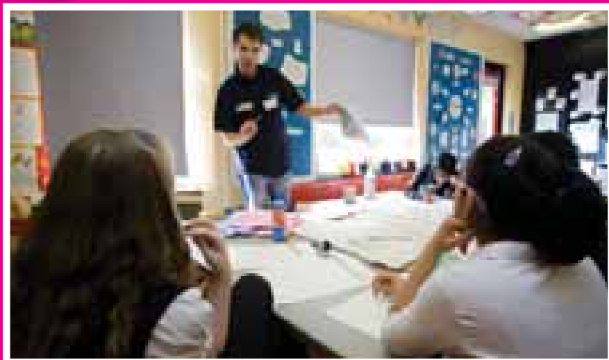
Velodream winners Students from Curwen Primary School in Newham, winners of last year's London 2012 'VeloDream' competition, build their own cycling hub with help from the designers and builders of the London 2012 Velodrome.