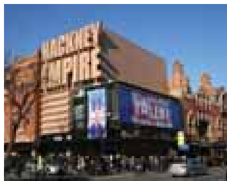
Hackney , Hackney Empire