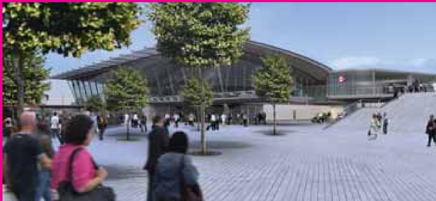
An artist's impression of the front of Stratford Station following the ODA's improvements

Work at the front of Stratford station moves ahead