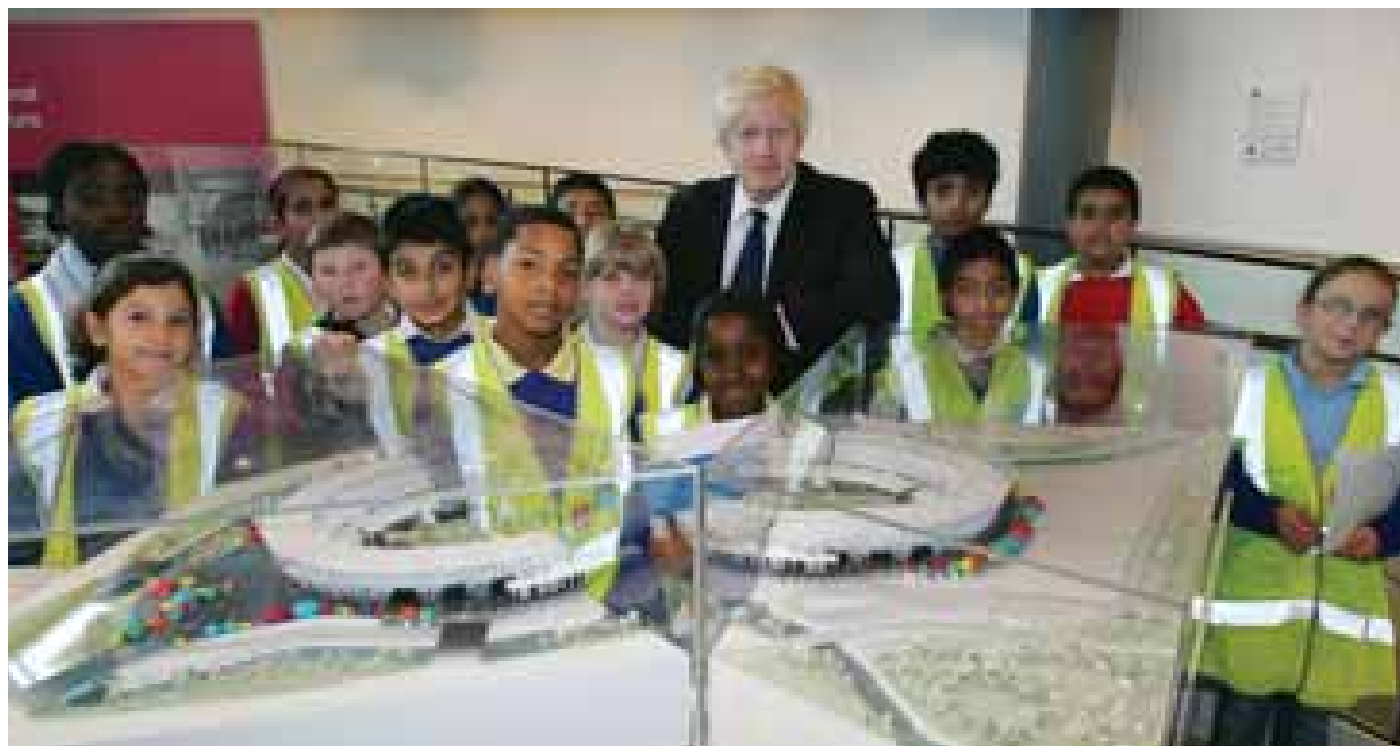
Construction Crew members meet Mayor of London Boris Johnson at a London 2012 exhibition in City Hall, home of the Greater London Authority

New Construction Crew members get involved in London 2012