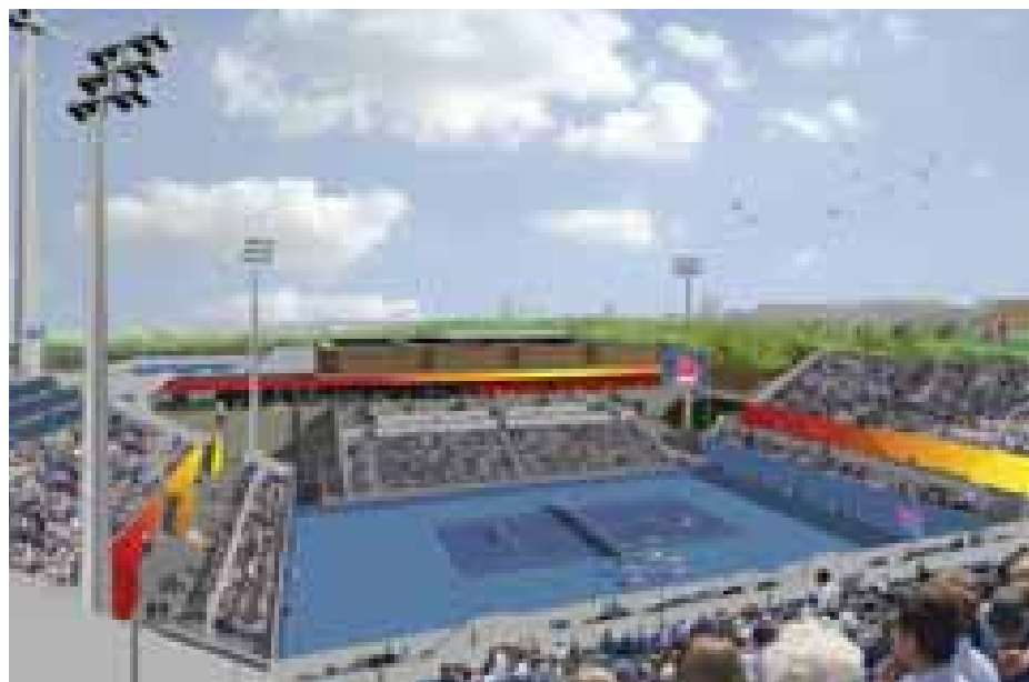
Eton Manor will host Wheelchair Tennis during the Paralympic Games

Towards the end of this year, the ODA also consulted local residents on planned improvements to Wick Lane and the proposals for how the Olympic Park's parklands and green spaces will be developed after the Games.