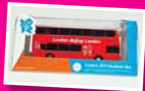
Toys Hornby plc is developing the first range of Christmas gifts associated with the London 2012 Games. They include this replica of the red London bus, which featured in the handover to London during the Closing Ceremony of the Beijing 2008 Games.