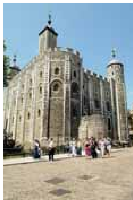
Tower Hamlets , Tower of London