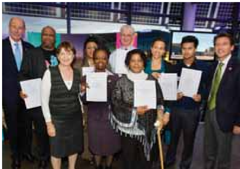
Local people graduate from the Olympic Park tour guiding course, which also taught them skills that they can use in future employment and training

Eleven people from the five Host Boroughs have graduated from a six-week training course to become employed Olympic Park tour guides.